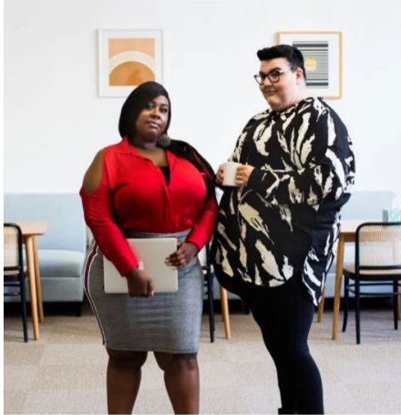
The Office Collection