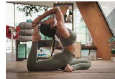
Yoga Class for Black Lives Matter at ...