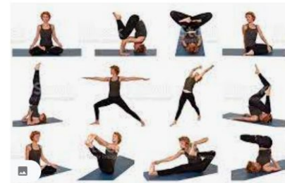
Collage Woman In Different Yoga Poses ... istockphoto.com