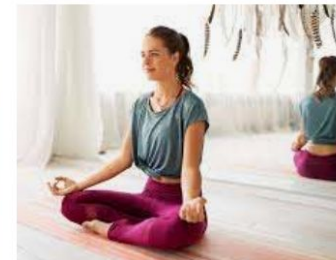
Ideal for COVID-19 Self-Isolation