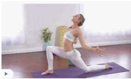
Morning Yoga for Women - YouTube youtube.com