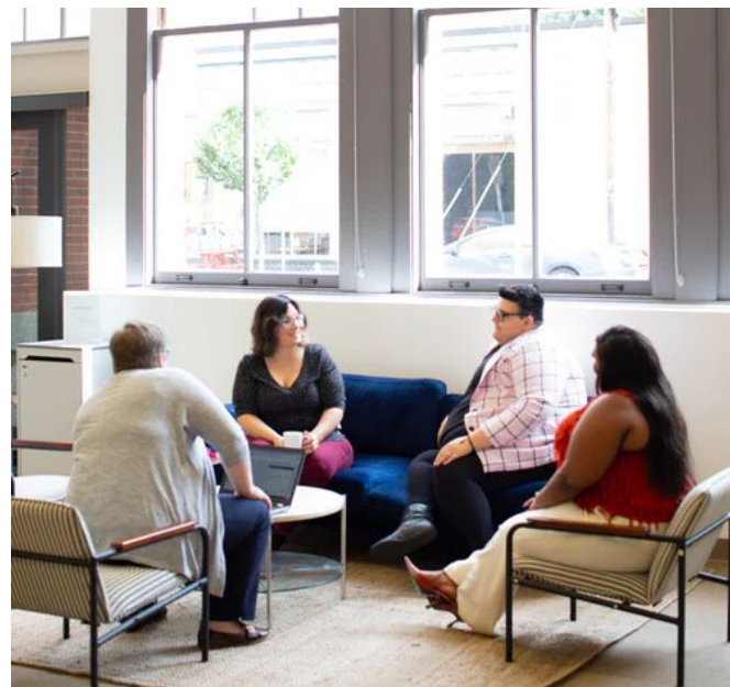
Photo featuring plus-size model by Michael Poley of Poley Creative for AllGo , publisher of free stock photos featuring plus-size people.

(Activity content adapted from Blicher et al. 2019)