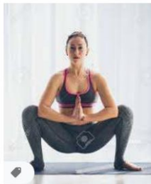
Kakasana. Beautiful Yo...