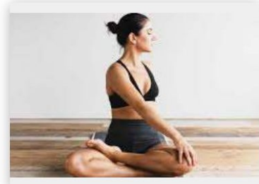
What is Hatha yoga? 10 Tips for ... womenshealthmag.com