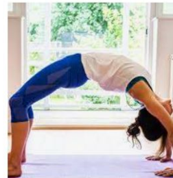
YogaGlo Is the Only Yoga A... self.com