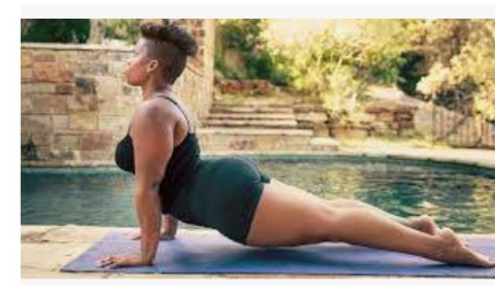
13 Benefits of Yoga That Are Supported ...