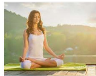
Yoga Asanas for Women: 5 Best Yo...