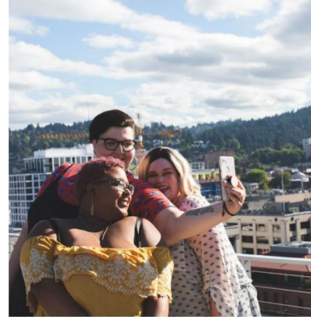
The Home Collection