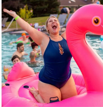
The Swim Collection